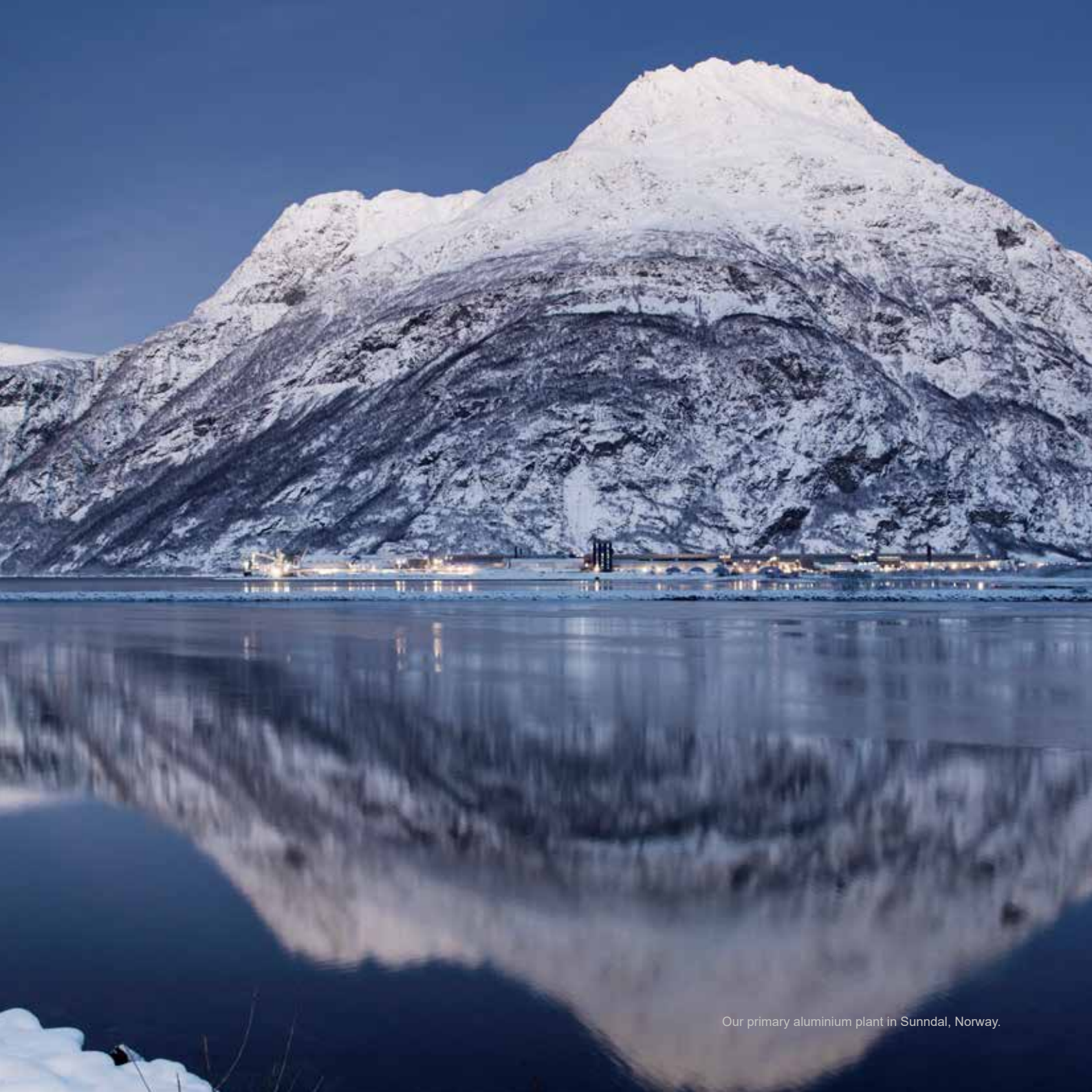
Our primary aluminium plant in Sunndal, Norway.